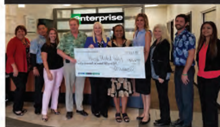
Enterprise, Alamo, National Car Rental