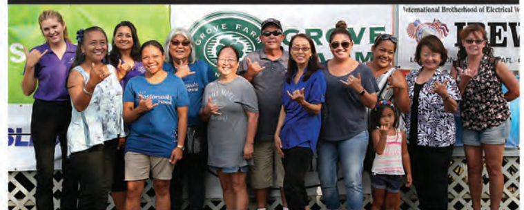
2018 Walk A Thon