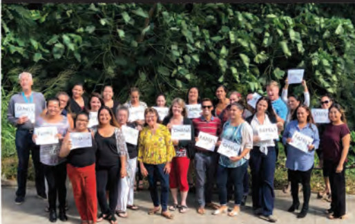
CHILD & FAMILY SERVICE