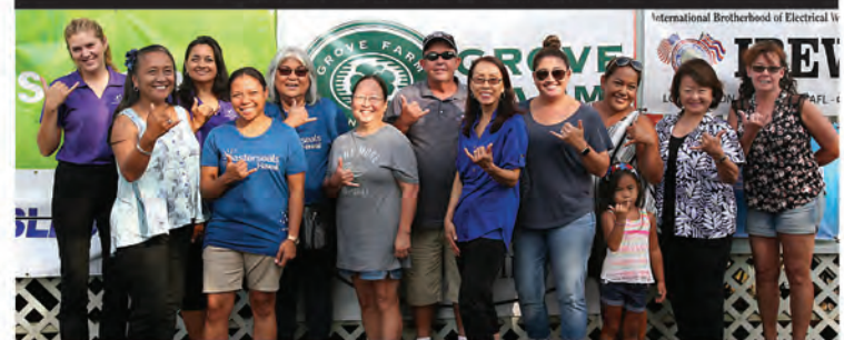
2018 Walk A Thon