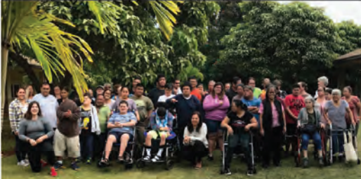
EASTER SEALS HAWAII