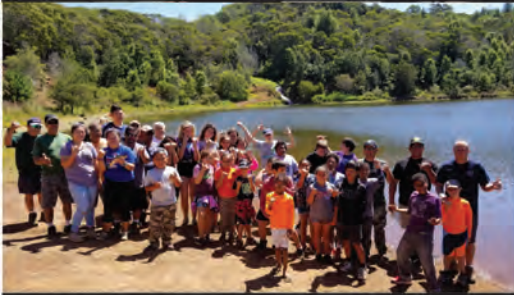
BIG BROTHERS, BIG SISTERS