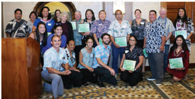
Top 15 Employee Groups of the 2017 Campaign