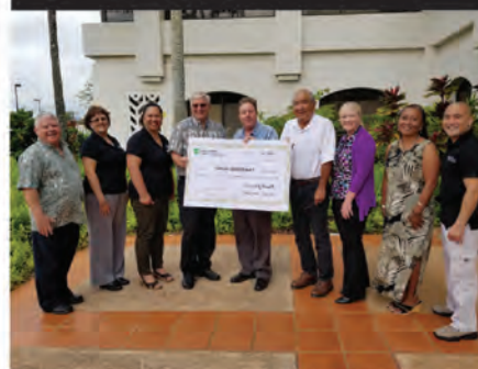
Kaua'i Island Utility Cooperative