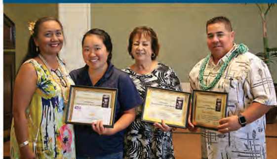
Top 3 Per Capita for the 2019 Campaign