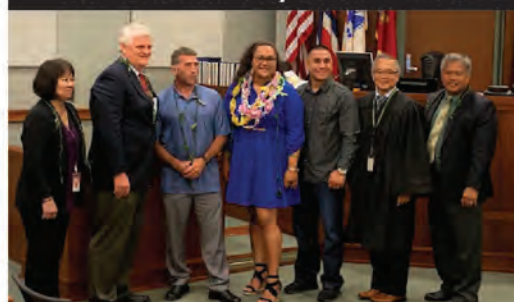
FRIENDS OF THE KAUA'I DRUG COURT