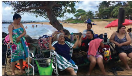
EASTER SEALS HAWAII – KAUA'I