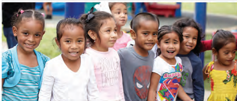
PACT – Kaua'i