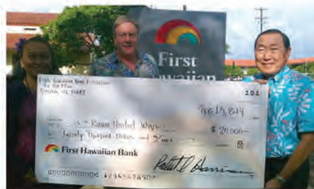
First Hawaiian Bank