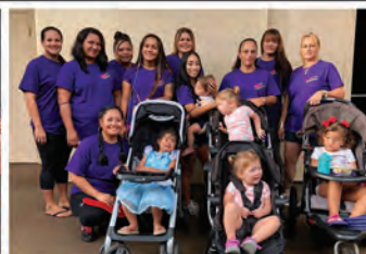
WOMEN IN NEED