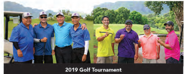
2019 Golf Tournament