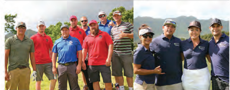
2019 Walk A Thon