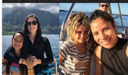
BIG BROTHERS, BIG SISTERS