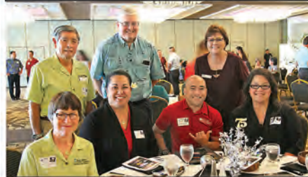
Kaua'i Island Utility Cooperative