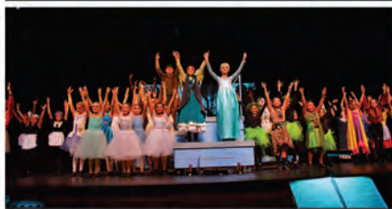
HAWAII CHILDREN'S THEATRE