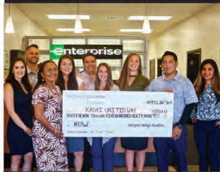
Enterprise Holdings Foundation