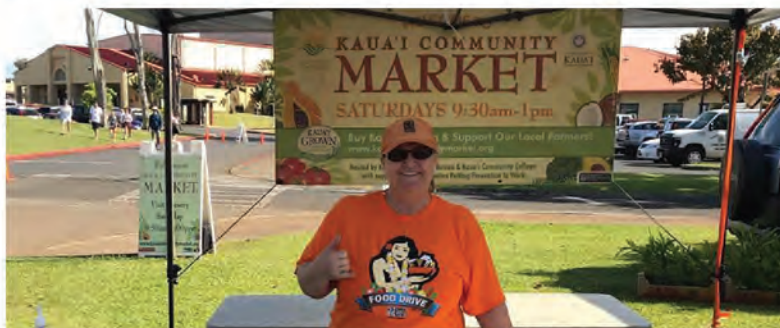
HAWAII FOOD BANK – Kaua'i Branch