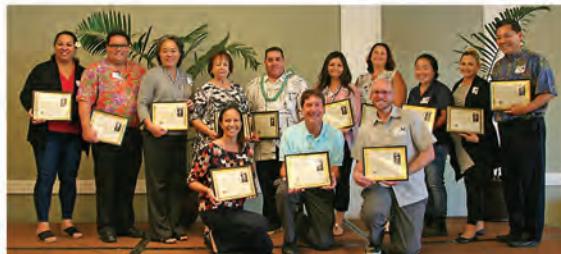
Top 15 Employee Groups for the 2019 Campaign